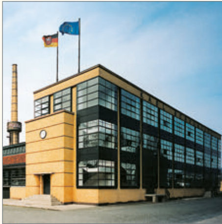
OUR HEADQUARTERS AT ALFELD - BUILT BY WALTER GROPIUS IN 1911